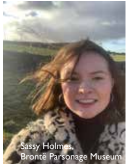
Sassy Holmes, Brontë Parsonage Museum

“Happiness quite unshared can scarcely be called happiness.”